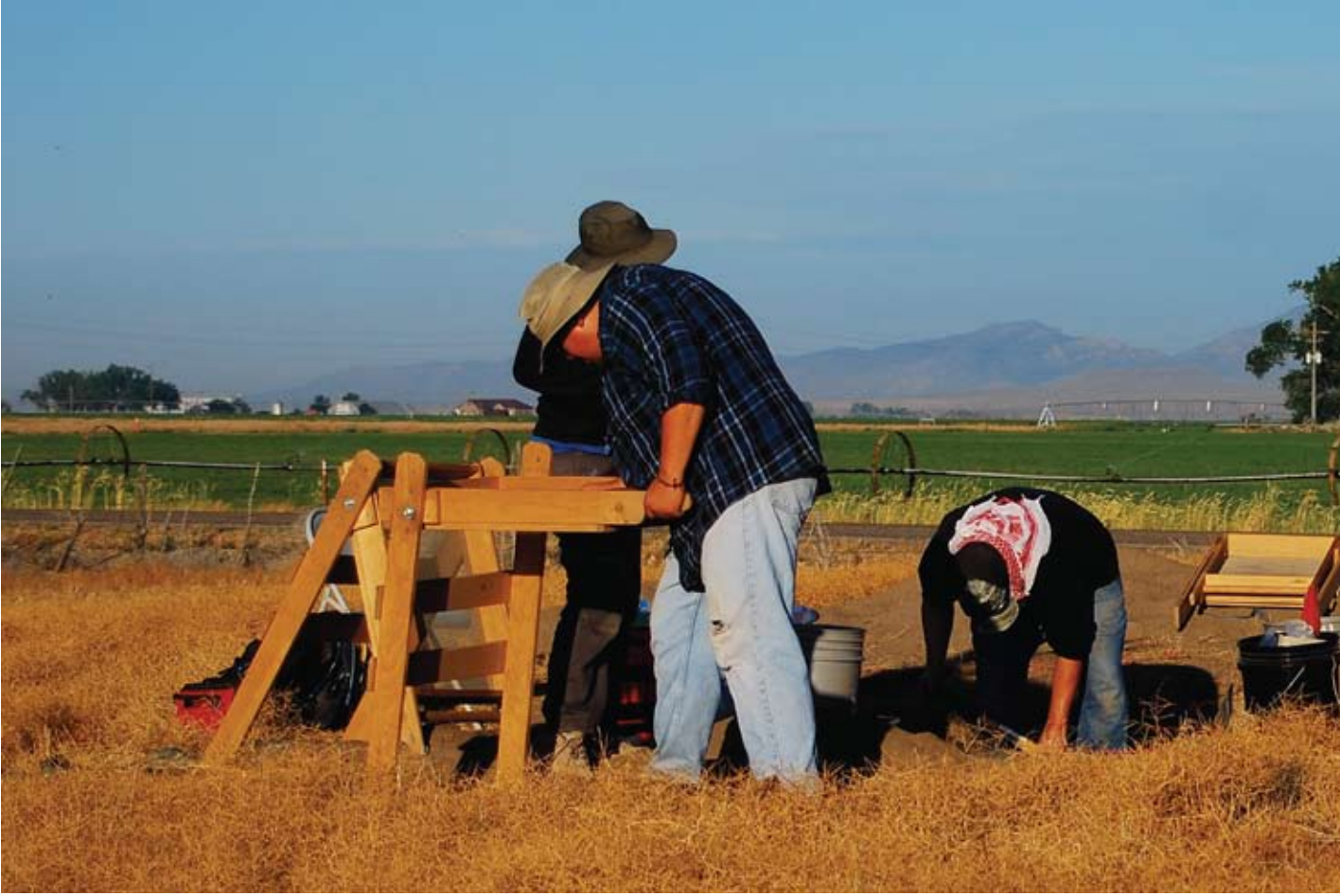
Students excavate and screen for artifacts on the site's primary mound.