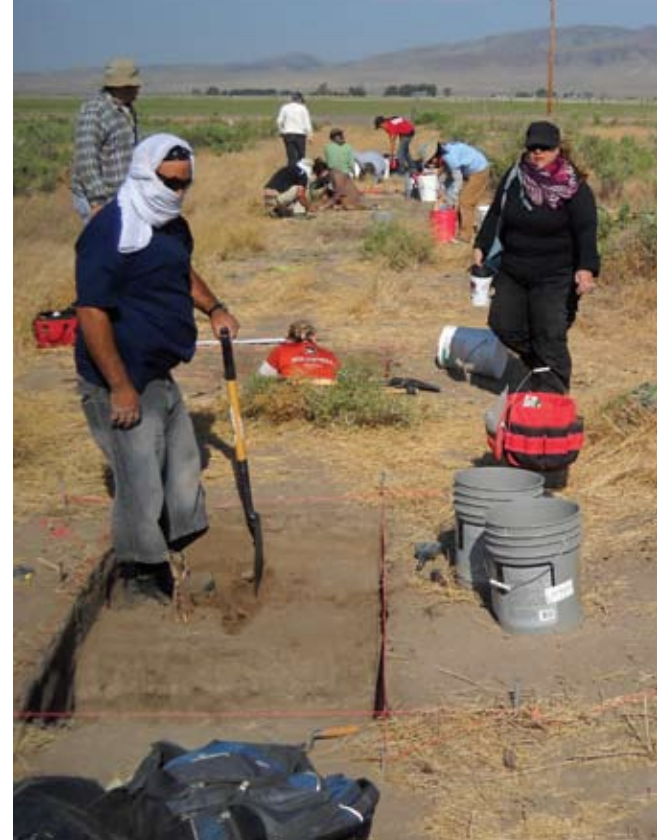
Students excavate one of the habitation areas damaged by roadwork.

rchaeologists aren't certain why the Fremont vanished around A.D. 1300, but a number of them, including Pritchard Parker, think it could have been 🕍 due to drought. She is more certain as to why the Fremont settled here in the first place: the fertile land around the