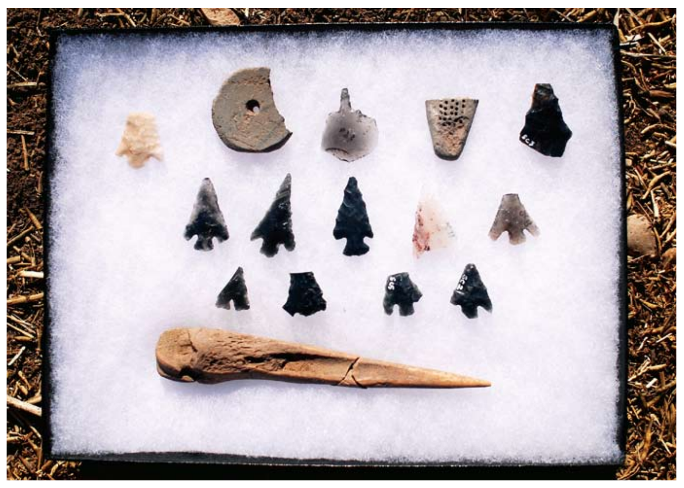
These are a few of the thousands of artifacts recovered from the site. In addition to the two projectile points at each end, the top row consists of a ceramic spindle wheel, a drill, and a figurine base. The next two rows feature a variety of projectile points, and beneath them is a bone awl.